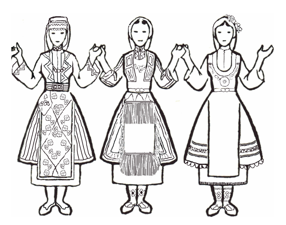
Bulgarian regions (see June issue for colour guide)